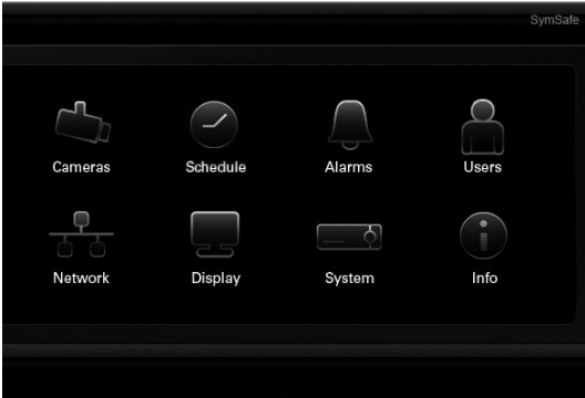
SymSafe On Screen Display: Main Menu

Deployed right from the SymSafe DVR, SymBrowser is a thin-client that provides live video and audio, search and playback, and configuration. The SymSafe On Screen Display (OSD) provides an easy-to-use interface as shown below.