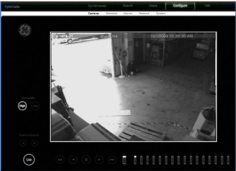
SymBrowser Remote Software